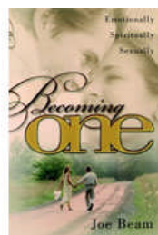
Becoming One by Joe Beam,