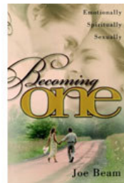
Becoming One by Joe Beam,